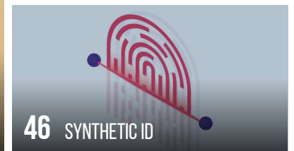
46 SYNTHETIC ID