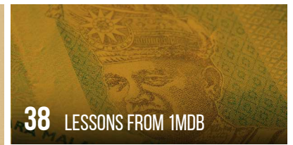
38 LESSONS FROM 1MDB