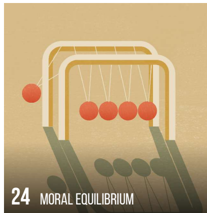
24 MORAL EQUILIBRIUM