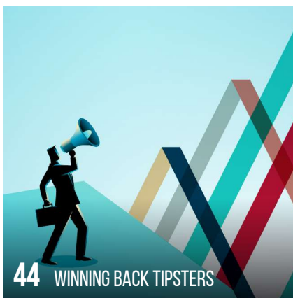
44 WINNING BACK TIPSTERS

Tipsters not trusting the system? Here's how to win them back